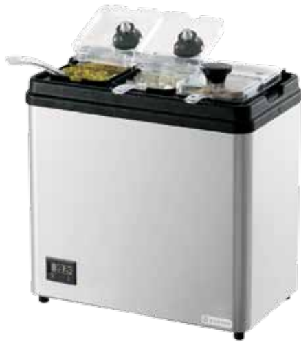
CC-1/3 NL COMBO 86006** ** INCLUDES (3) 1/9-SIZE JARS (87203), CLEAR LIDS (87253) AND SPOONS (85156) ALSO AVAILABLE WITHOUT ACCESSORIES - CC-1/3 NL (86140)