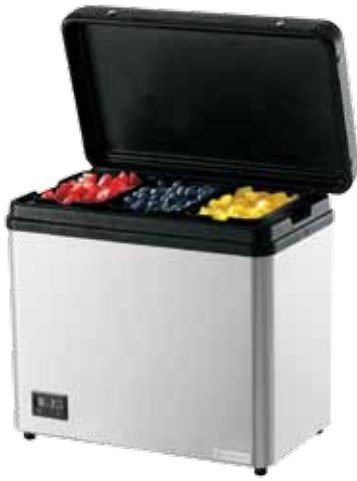
CC-1/3 86080* * SHOWN WITH (3) 1/9-SIZE JARS (87203), NOT INCLUDED

Models CC-1/3, CC-1/3 NL Combo & CC-1/3 NL