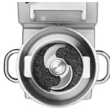
R10U- bowl- within-a bowl