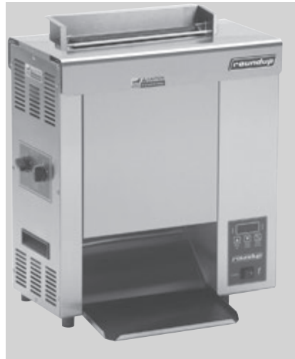
VCT-2000 with Wide Mouth Bun Feeder