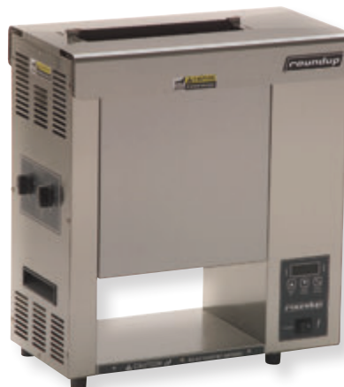
VCT-2000 with Heated Base

The Vertical Contact Toaster model VCT-2000 is designed for contact toasting of buns. The toaster design allows the operator to place buns on both sides of the heated platen at the same time. Buns are placed into the top of the toaster and uniform, golden brown, warm buns are then retrieved at the bottom.