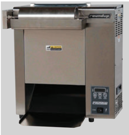
VCT-2000 with Mechanical Butter Wheel