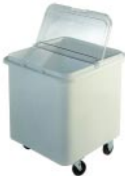
5027 - Ingredient Bin