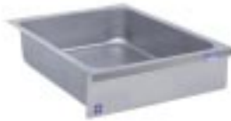
185 - Standard Drawer