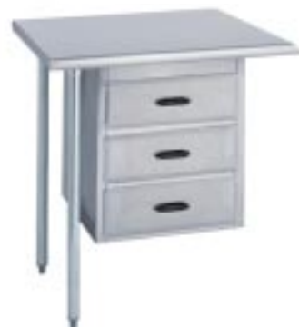
731 - Tier of Drawers