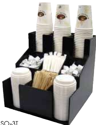
CLSO-3T 12-5/16"L x 12-3/4"W x 13-1/8"H