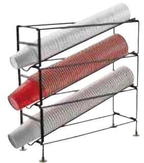
CDR-3 20"L X 6-1/4"W X 19-1/4"H