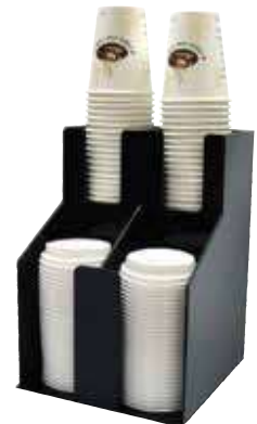
CLO-2D 8-1/2"L x 8-5/8"W x 12-1/4"H