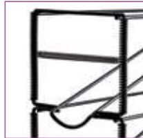
Twist springs on cup rack to adjust for different cup sizes