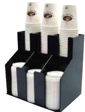
CLO-3D 12-11/16"L x 8-5/8"W x 12-1/4"H