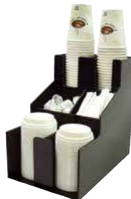
CLSO-2T 8-1/2"L x 13-1/16"W x 12-3/16"H