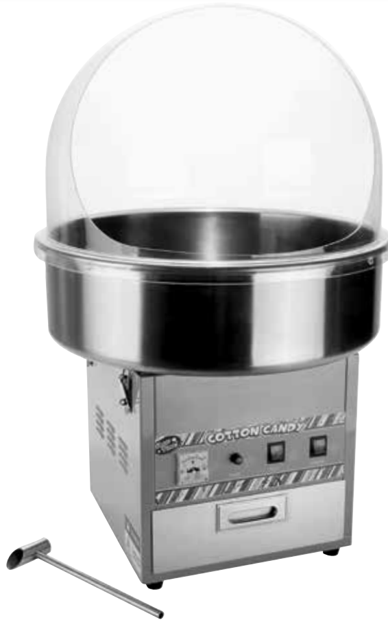
CCM-28C, sold separately