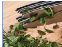
Cut, chop, mince herbs