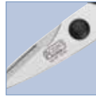
Built-in bottle cap opener