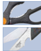
Built-in cracker and bottle cap opener