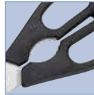
Built-in cracker or bottle cap grip