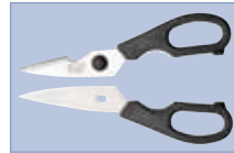
KS-06 is detachable