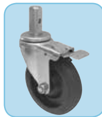
ALRC-5STK 5" caster with brake