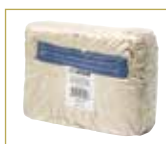
Brick pack is standard