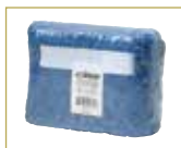
Brick pack is standard