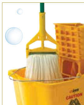
MOPM-M shown with MOPH-7P handle and MPB-36 mop bucket