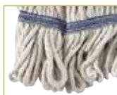
Looped ends prevent unraveling