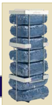
Holds 7 brick packs