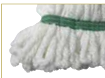
Looped ends prevent unraveling