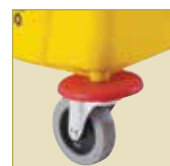
Non-marking casters with bumpers