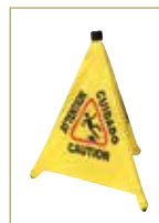
Set includes pop-up "Caution" cone