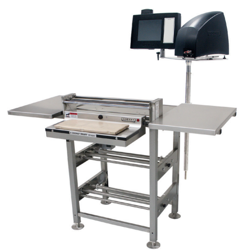
Access Scale Hand-Wrap System with Color Touch Screen