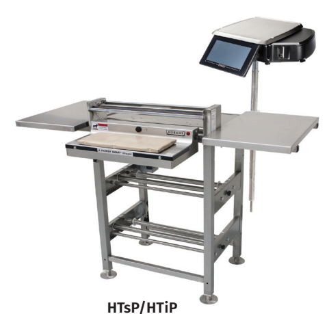
Hand-Wrap System with Color Touch Screen