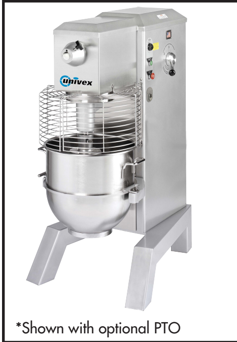
*Shown with optional PTO