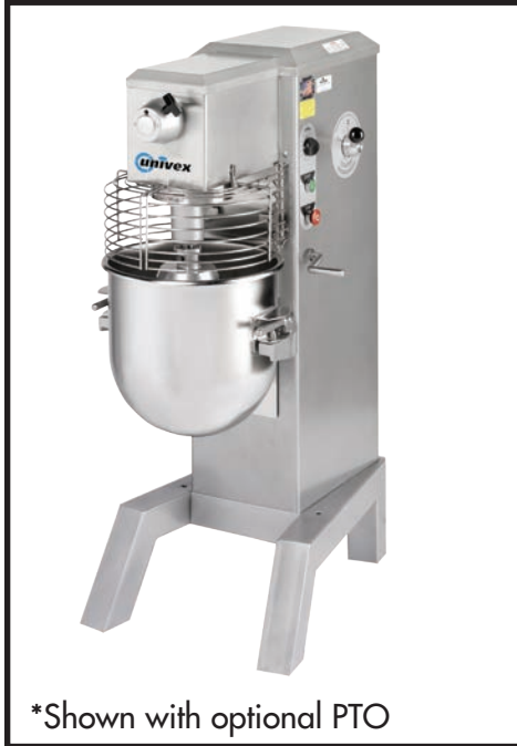
*Shown with optional PTO