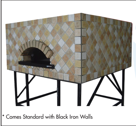
* Comes Standard with Black Iron Walls