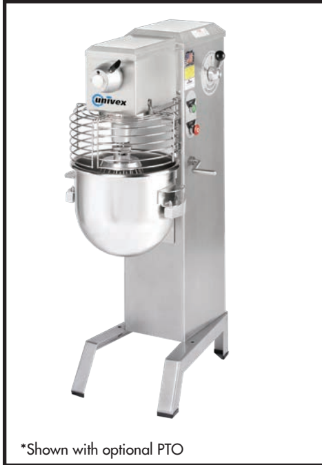
*Shown with optional PTO