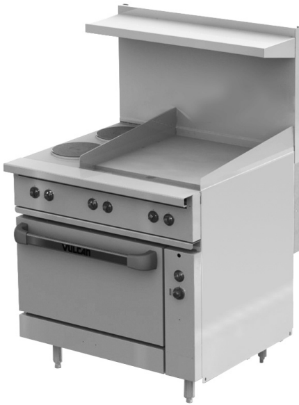
Model EV36S-2FP24G208 shown with adjustable legs