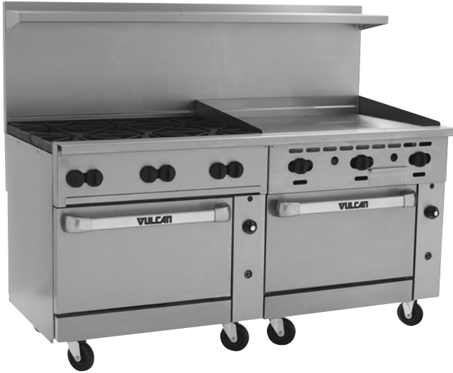
Model 72SS-6B36GN (shown with optional casters)