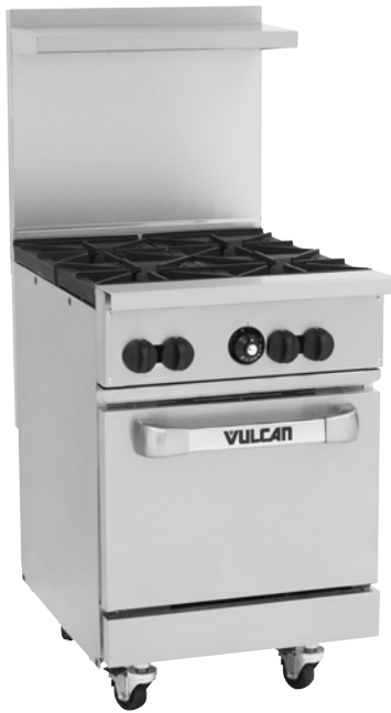
Model 24S-4N (shown with optional casters)