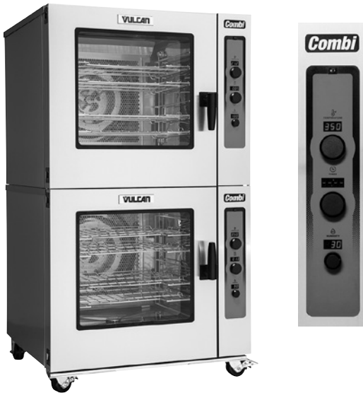
Model ABC7E (shown stacked)