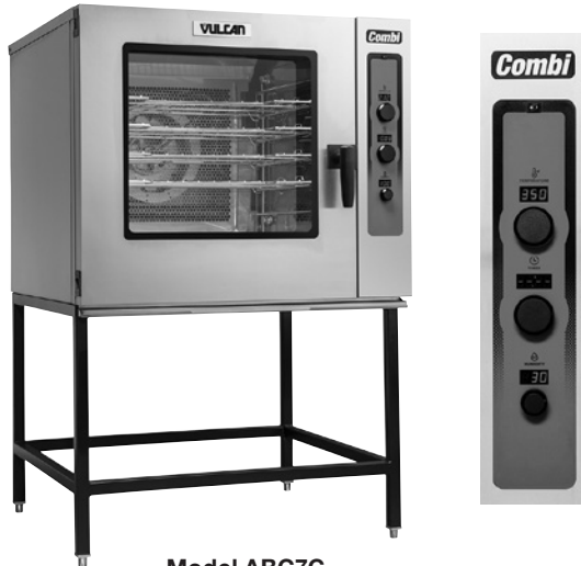
Model ABC7G (shown on stand)