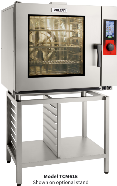
Model TCM61E Shown on optional stand