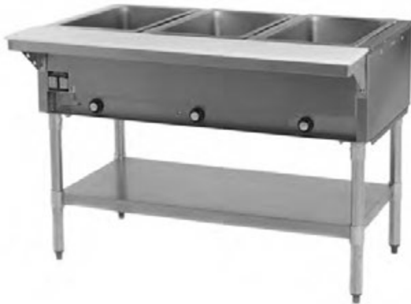
#DHT3-120 hot food table

Eagle Hot Food Tables, open base design, model _____ . Top and body to be heavy gauge type 430 stainless steel. Beaded top openings to be 12 \frac{3}{32} " x 20 \frac{3}{32} ". Heating compartments to be 8"-deep, galvanized, and insulated on all four sides and bottom with 1" fiberglass or equal. Recessed control panel, with individual infinite controls, offer high and low settings. Each compartment fitted with 500-watt heating element for 120-volt units, and 750-watt heating element for 240-volt units. 6' cord and plug extends from the bottom right hand side of the unit. Furnish with polycarbonate cutting board. Legs to be 1 \frac{1}{2} " O.D. tubing, with adjustable undershelf and adjustable bullet feet.