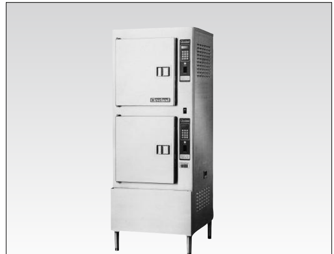
Shown with optional Electronic Timer