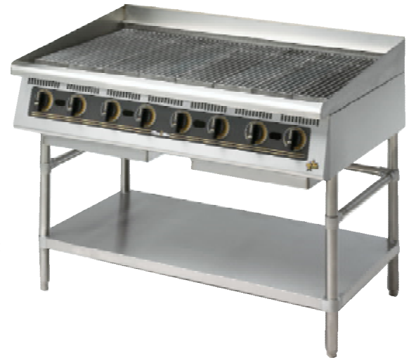
Model 8148RCB Shown with Optional Mobile Equipment Stand