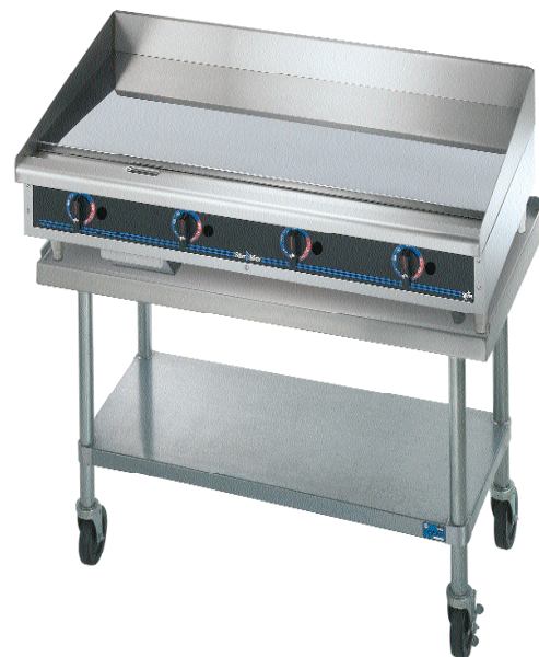
Model 648TCHSD with Optional Equipment Stand and Casters