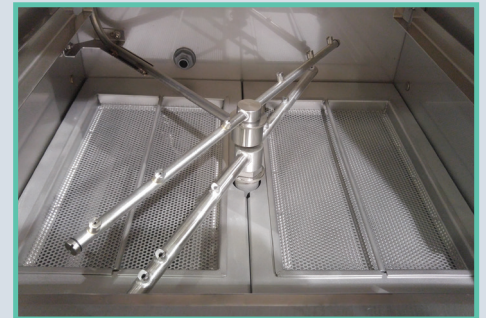
Interchangeable Scrap Baskets