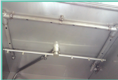
Halo Wash Arm