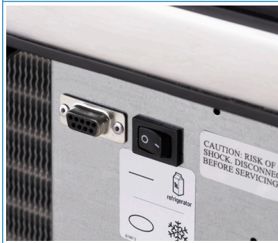
Refrigerator/Freezer Toggle Switch located Behind the Grill