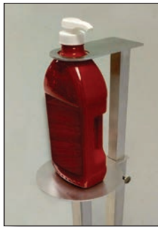
Shown Above With 1.5 Quart Container