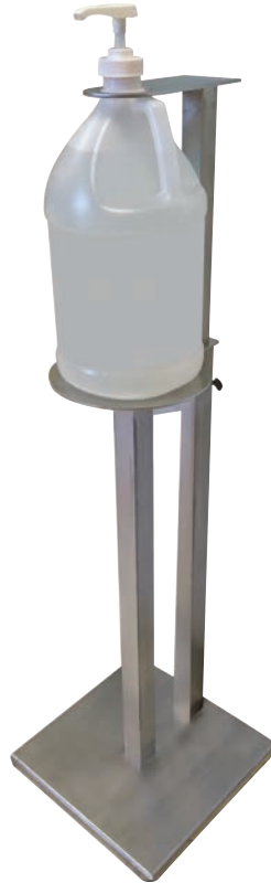
Shown Above With Gallon Container