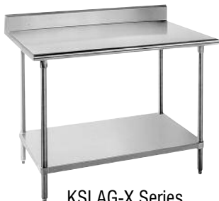
KSLAG-X Series 5" Backsplash