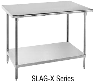
SLAG-X Series Flat Top