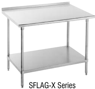
SFLAG-X Series 1 1/2" Backsplash

LEGS: 1 5/8" diameter tubular stainless steel. Stainless steel gussets. 1" adjustable stainless steel bullet feet.