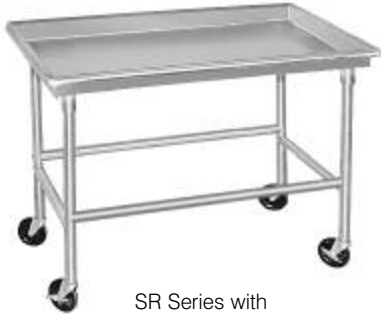
SR Series with Optional Casters