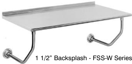
1 1/2" Backsplash - FSS-W Series