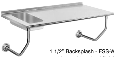
1 1/2" Backsplash - FSS-W Series (shown with optional Sink Bowl)