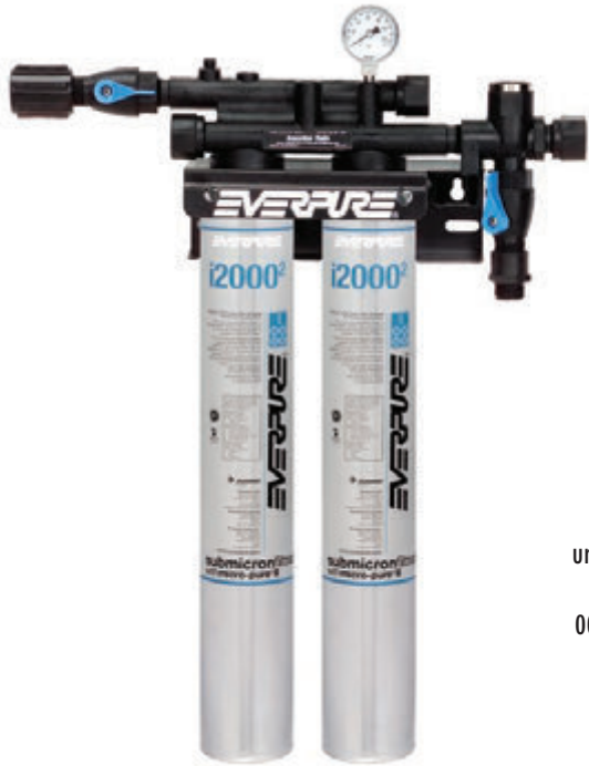
Insurice Twin-i2000 2 System: EV9324-02

Delivers premium quality water for ice applications