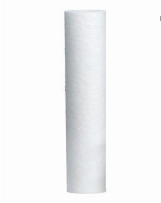
EC110 Prefilter Cartridge: EV9534-12