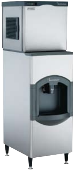
HD22 shown with a Prodigy C0322A cuber