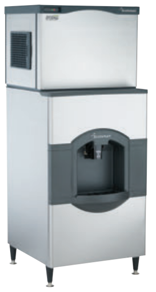
HD30 shown with a Prodigy CO330A cuber