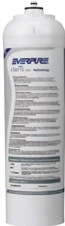
Claris X-Large Cartridge: EV4339-13