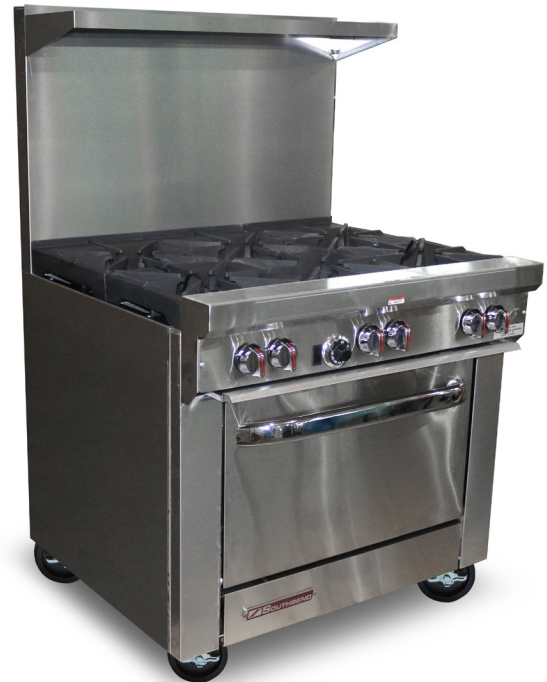
(S36D shown with optional casters)