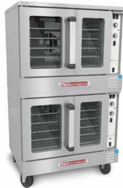
(shown with optional casters)