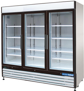
69K-123HC (Doors: Sliding) 69K-113HC (Black, Doors: Sliding)