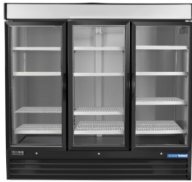
69K-056HC (Color: Black)