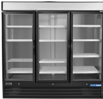
69K-059 (Color: Black)

Glass door merchandisers are designed for durability and visual appeal in promoting your product. Glass door merchandisers are energy efficient and effective at keeping product at exactly the right temperature to preserve freshness, prolong shelf life and prevent freezer burn. Simple-to-use, programmable solid-state digital controls deliver accurate temperature regulation. An oversized refrigeration system provides energy efficiency, rapid recovery and consistent minimal change in the internal environment even if the door is opened frequently.