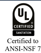
Certified to ANSI-NSF 7