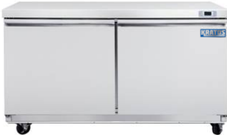
69K-752HC 2 Door

KRATOS Undercounter Refrigerators hold your products at their ideal storage conditions, promoting longer shelf life and preserving freshness. These undercounter refrigerators make the most of available space and provide excellent service. The stainless steel exterior provides durability and ensures years of reliable service if properly maintained. The unit's foam insulation and forced air cooling system deliver precise food storage temperature regulation.