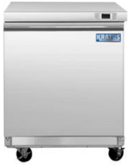
69K-767HC 1 Door

Model: 69K-767HC 1 Door 69K-768HC 2 Door 69K-752HC 2 Doors