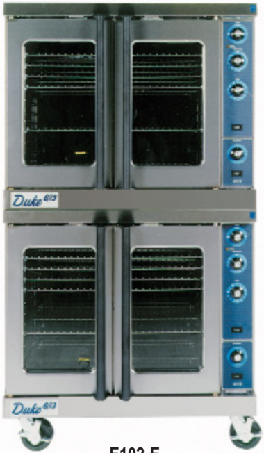
E102-E (Shown w/optional casters)