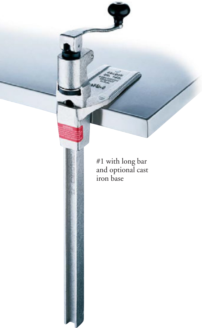
#1 with long bar and optional cast iron base