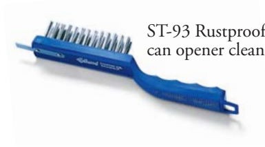
ST-93 Rustproof can opener cleaning tool