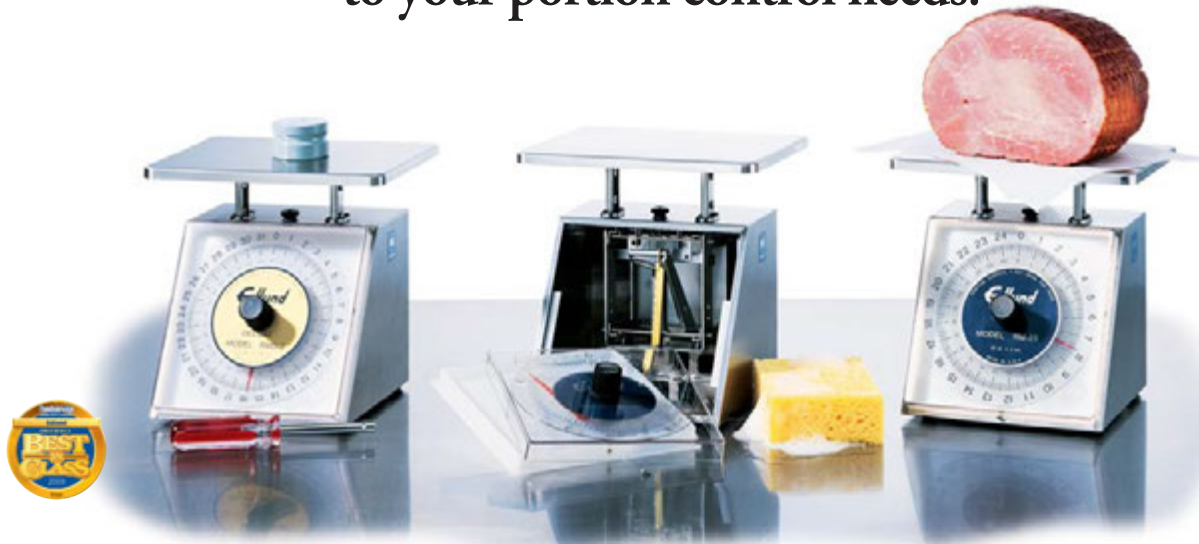
Shown with CK-32 calibration kit.