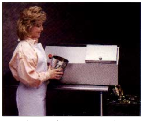
Crushed can falls into receptacle.