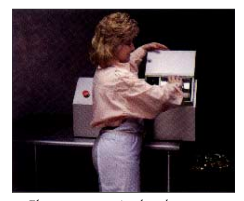
Place empty can in chamber.