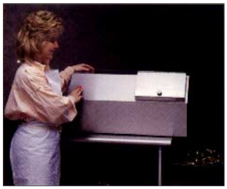
Close safety lid. Press button.