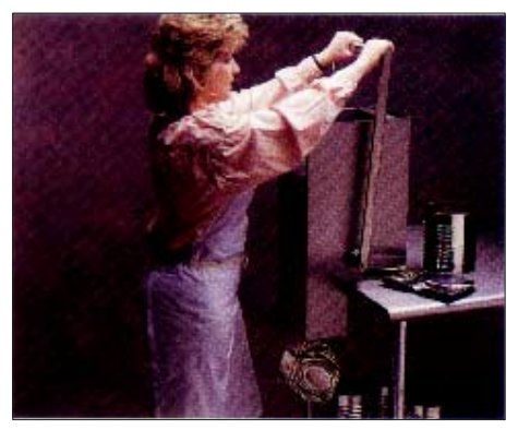
Return handle to upright position. Crushed can falls into receptacle.