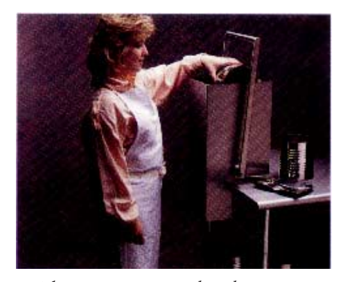
Place empty can in chamber.

CH-5000 30" L x 16" H x 12" W 76.2 cm x 40.6 cm x 30.5 cm CA-3000 26" L x 7½" H x 9" W 66.1 cm x 19.1 cm x 22.9 cm