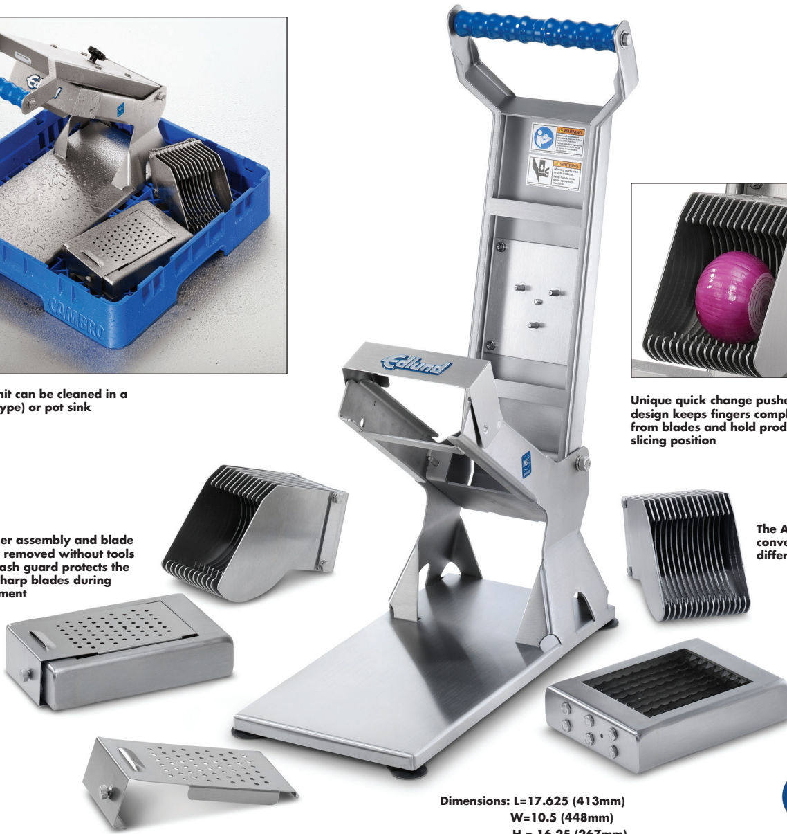
The ARC! can quickly convert to three different sizes

Dimensions: L=17.625 (413mm) W=10.5 (448mm) H = 16.25 (267mm)