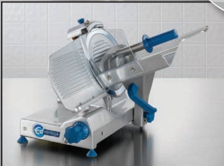
EDV-10C 10" Compact