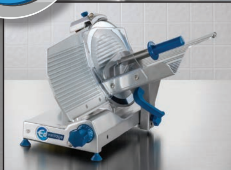
EDV-12C 12" Compact