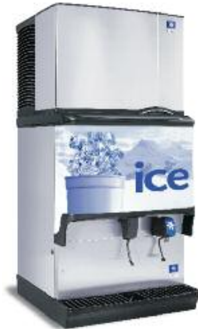
S-250 with water valve