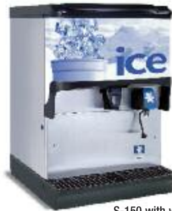
S-150 with water valve

Servend's S-Series ice dispensers feature a no-hassle one-piece structural base, strengthened drive train, and modular design, all resulting in a more durable ice dispenser.