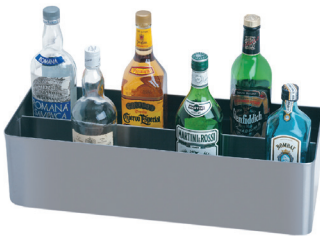
Double Speed Rail D-24 shown