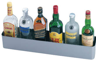
Single Speed Rail S-24 shown